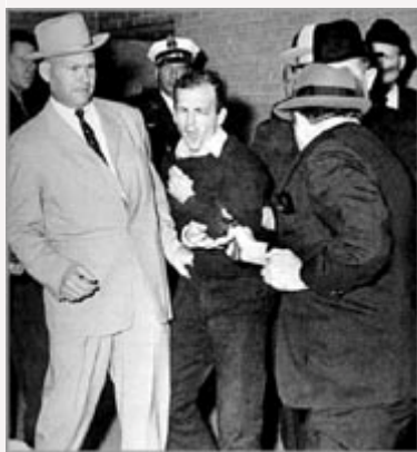
Lee Harvey Oswald

The riddle of the murder of the American President John Kennedy in November 1963 remains the one of the main mysteries of the XX century. First, the official version of the Warren commission on the lone assassin Lee Harvey Oswald is full of discrepancies and white spots. Secondly, majority of the people directly or indirectly involved in the murder very soon died under rather strange or mysterious circumstances. Oswald was shot in prison and his murderer died from cancer, the journalist who took his interview shortly before his death