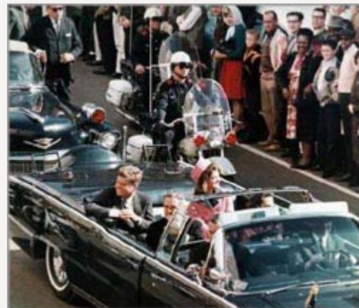
The last moments of John Kennedy